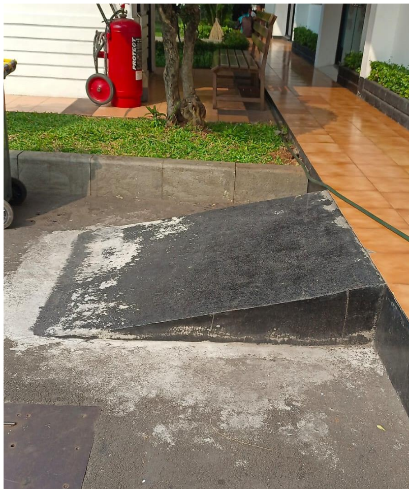
JALAN RAMBATAN KURSI RODA